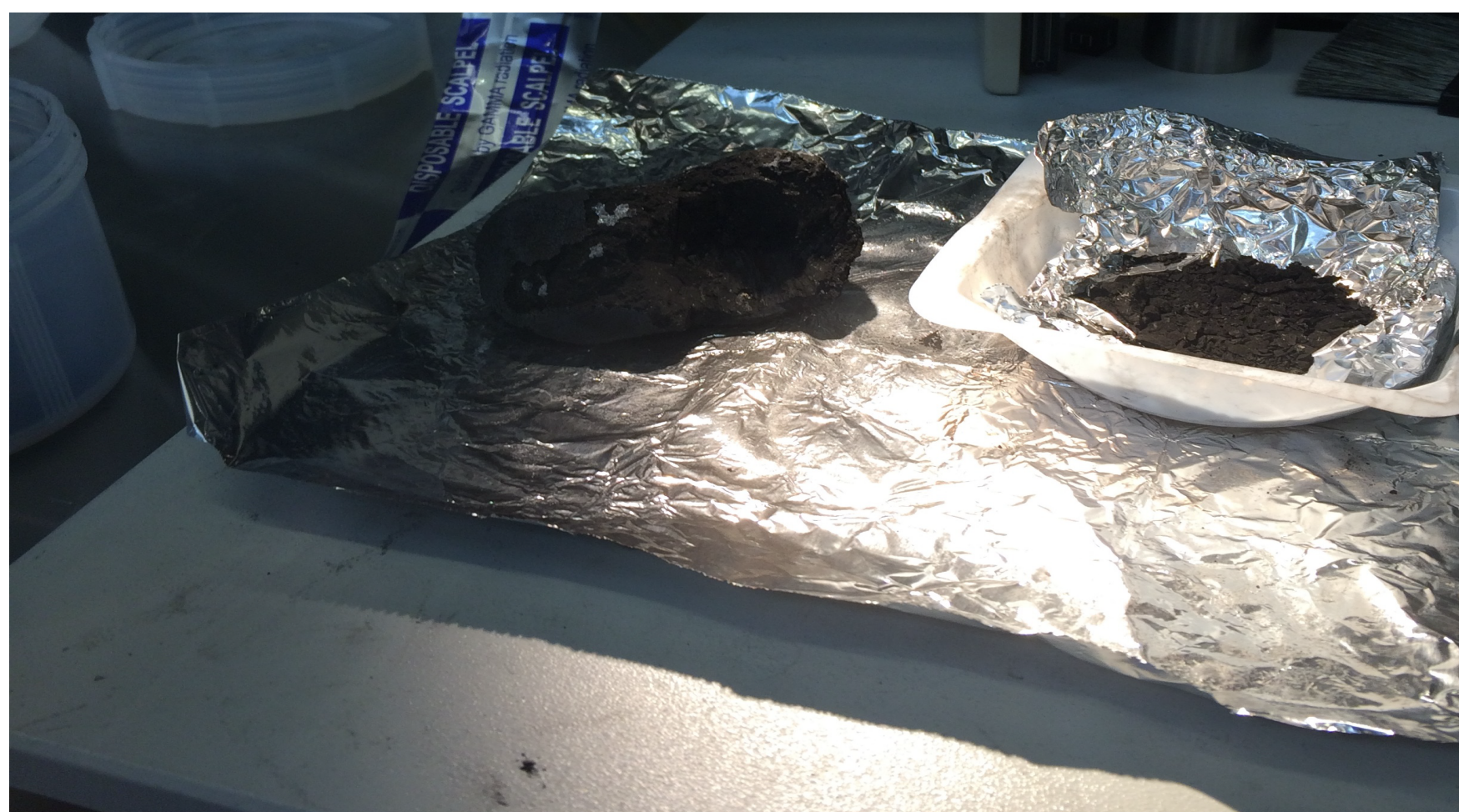
Figure 1: Sampling of the Tagish Lake specimen 10a

A ca. 2 gram subsample of the Tagish Lake specimen 10a was analyzed by our new SPME(PDMS/DVB* or PEG** fibers)-GC(CP-Volamine) method.