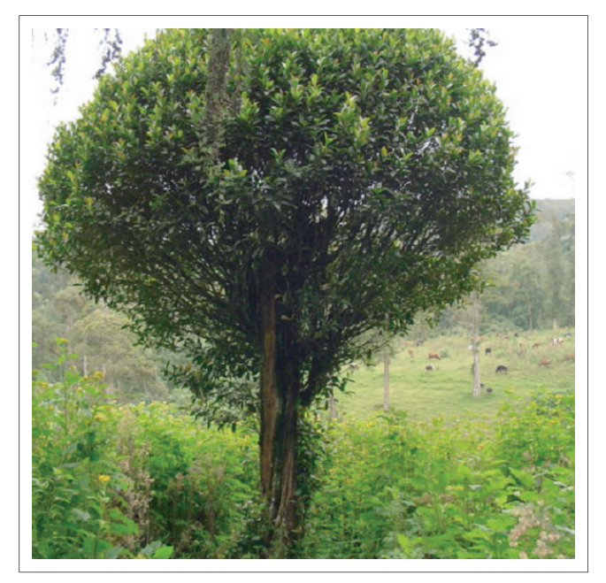
FIGURE 1: The Ixora scheffleri subspecies keniensis plant.

Ixora , belonging to the family Rubiaceae, is a large rain forest genus comprising shrubs and small trees. Estimates of species number range between 300 and 400 (Bridson 1988). Two sub species of I. scheffleri have been identified: I. scheffleri subsp. keniensis and I. scheffleri subsp. scheffleri . I. scheffleri subsp. keniensis is a small tree (Figure 1), up to 8 m tall with opposite long narrow leaves. Flowers are whitish-pink with a long corolla tube. The I. scheffleri subsp. keniensis plant (called