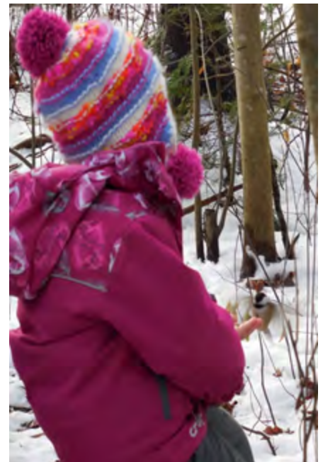
Figure 2. "In the woods" image from nature journal.

These tellings are delightful and we delight in them ourselves; however, we realize, as with any telling, they remain partial. In their partiality, chickadee biographies, for example, are biographies in the interest of serving the children's learning in the moment. In an effort to shift ourselves into com-