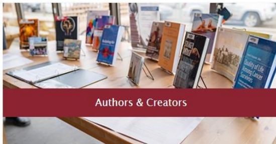
Authors & Creators