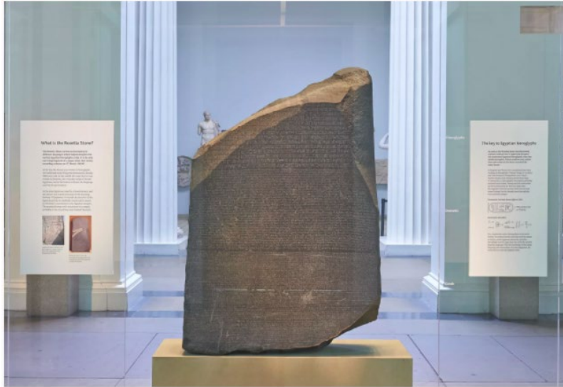
Figure 3: The Rosetta Stone on display in Room 4.

The stone is displayed free standing in a case of glass to prevent individuals from touching it. While the Rosetta Stone does have information posted on its' left and right, the placement of the stone does not reflect its' original context. The stone is displayed in a minimal fashion that without reading the information or looking closely to see the Egyptian hieroglyphics, it is not immediate to the viewer of what they are looking at. The Rosetta Stone is far removed from its' original cultural context. It is not surrounded by other Egyptian antiquities and there is no information on what the entire stele would have possibly looked like before it was broken. Without this historical context an individual viewing the Rosetta Stone without background knowledge would not draw the conclusion that it is a religious relic.